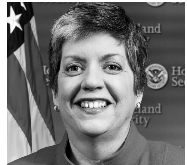
U.S. Secretary of Homeland Security Janet Napolitano

Department of Homeland Security (DHS) Secretary Janet Napolitano delays the implementation of a rule requiring federal contractors with contracts over $100,000 to use the E-Verify program from February 20 to May 21. The rule was promulgated to comply with executive order 13465 by President George W. Bush, which directed federal agencies to require those they contract with to verify the work authorization of their employees. The original deadline for the rule's implementation was January 15, 2009, but it was delayed due to a lawsuit filed by the U.S. Chamber of Commerce.