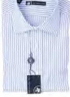
Blue and White Multistripe Dress Shirt