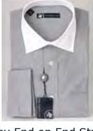
Grey End on End Stripe Dress Shirt

Track Your Order | Contact Us / Store Locations