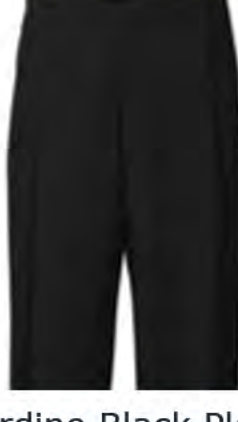
Gabardine Black Pleated Trousers