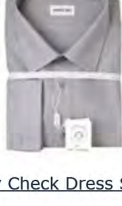
Grey Check Dress Shirt