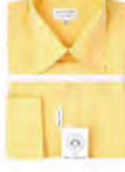
Yellow Light Stripe Dress Shirt