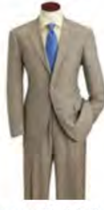
Brown Plaid Suit