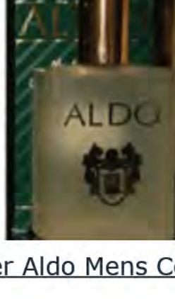
Vetiver Aldo Mens Cologne