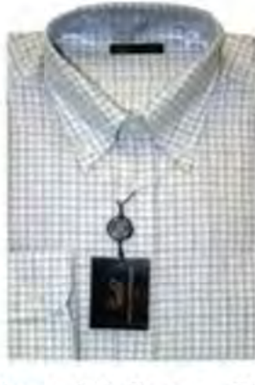
Custom Fit Dress Shirts